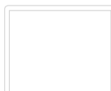
White - 0003