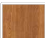
Golden Oak - 1110