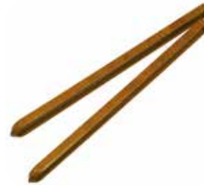
4503 Laminated universal trim

Colour options: 0003 White / 1111 Rosewood / 1110 Golden Oak