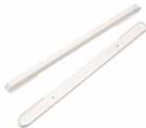
4502 Laminated joint trim

Colour options: 0003 White / 1111 Rosewood / 1110 Golden Oak