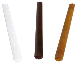
4501 Laminated end cap

0003 White / 1111 Rosewood / 1110 Golden Oak